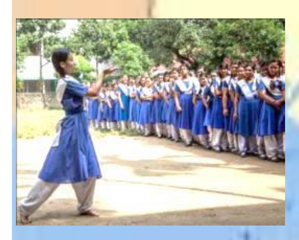
St. Scholastica's student performing a welcome dance