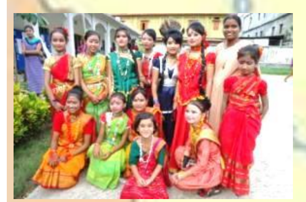
Sreemongal tribal hostel girls dressed up for a cultural show