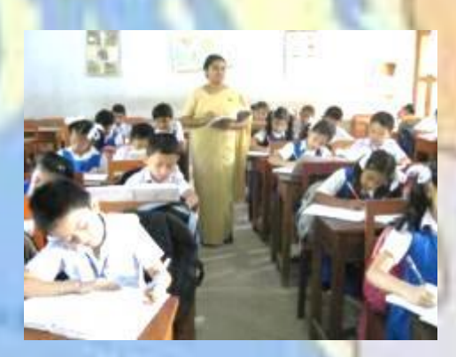
Sr. Pronoti & St. Teresa's students busy doing their assignment