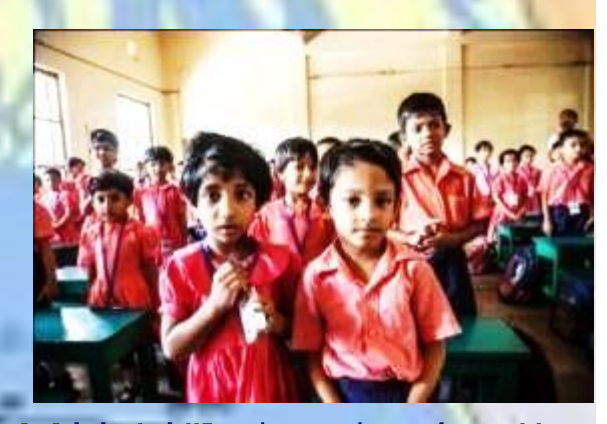
St. Scholastica's KG students ready to welcome visitors