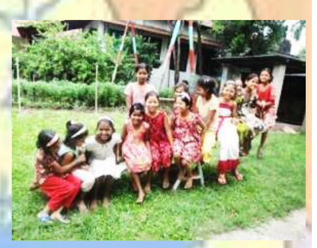
St. Peter's girls enjoying their free time

Pastoral Work: Sisters are actively involved in various parish committees and activities e.g. preparation for sacraments and liturgy, taking the Holy Eucharist to the sick, family apostolate, marriage encounters, youth ministries --- Holy Childhood and Young Christian Student (YCS) movement.