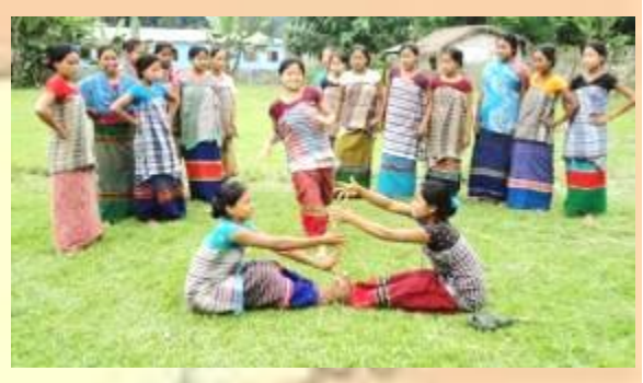
Tripura girls in the hostel enjoying their leisure time.