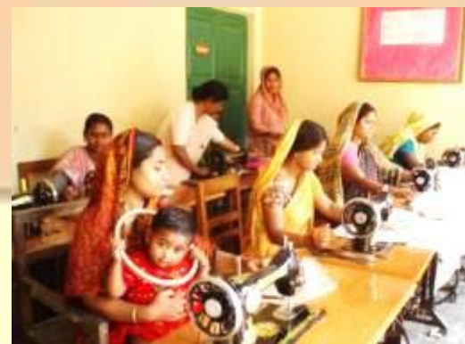
Sr. M. Edward training the women in the sewing centre to earn their daily bread and thus raise their status