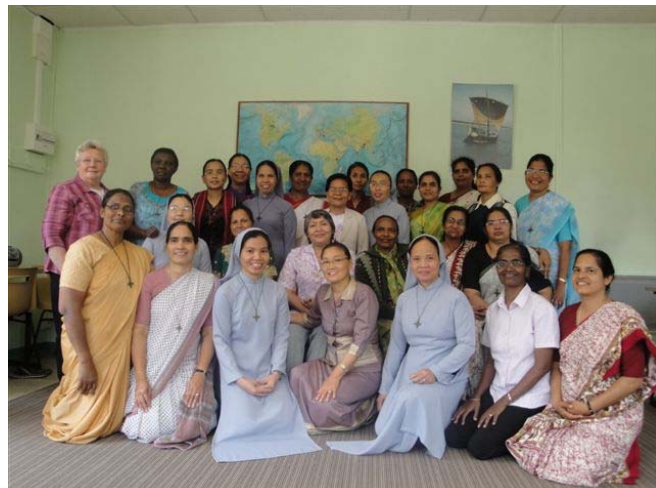
(left) A group from Cor Unum gathers for prayer during their retreat at l' Abbaye (right) The 2011 international group of our Sisters gathered for their six week session at St Rambert.