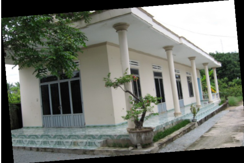
Photo: The small school at Vinh Trang, Vietnam, built with money raised by the France Vietnam Association, along with a donation from the city of Toulon.