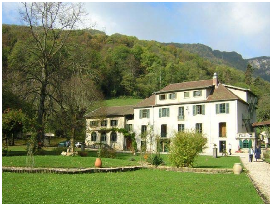
The main house at St Rambert which welcomes residential and day groups for retreats, conferences, the sacraments, Congregational and parish activities.