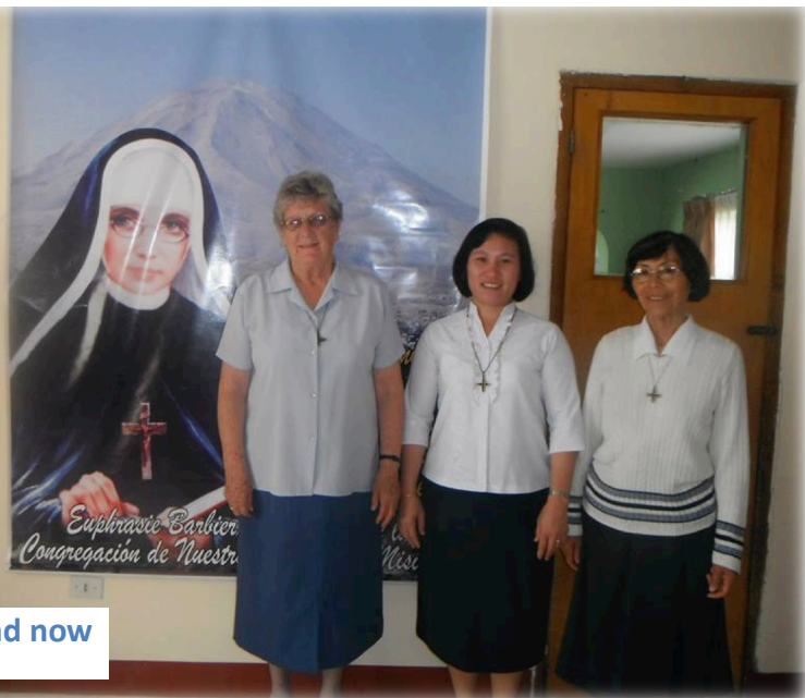
RLT before and now