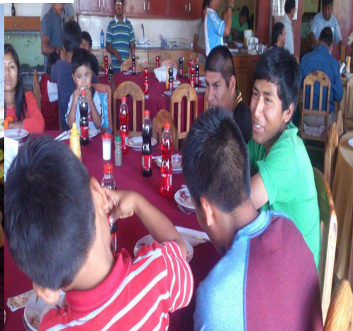
Orphans in Hogar Belen Moquegua