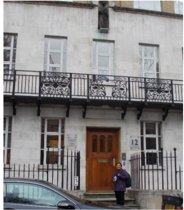
Great Titchfield St - Walking in the Footsteps of Euphrasie - Queen Square