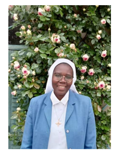
RNDMs present in the region