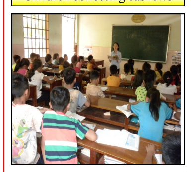
Extra tuition classes