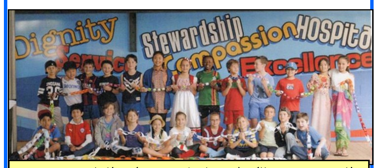
Aranmore Catholic Primary School, Leederville, WA, Australia

ARANMORE CATHOLIC PRIMARY SCHOOL, LEEDERVILLE, WA PARTNERING WITH ST. JOHN BOSCO'S SCHOOL, CHERRAPUNJI, NE INDIA