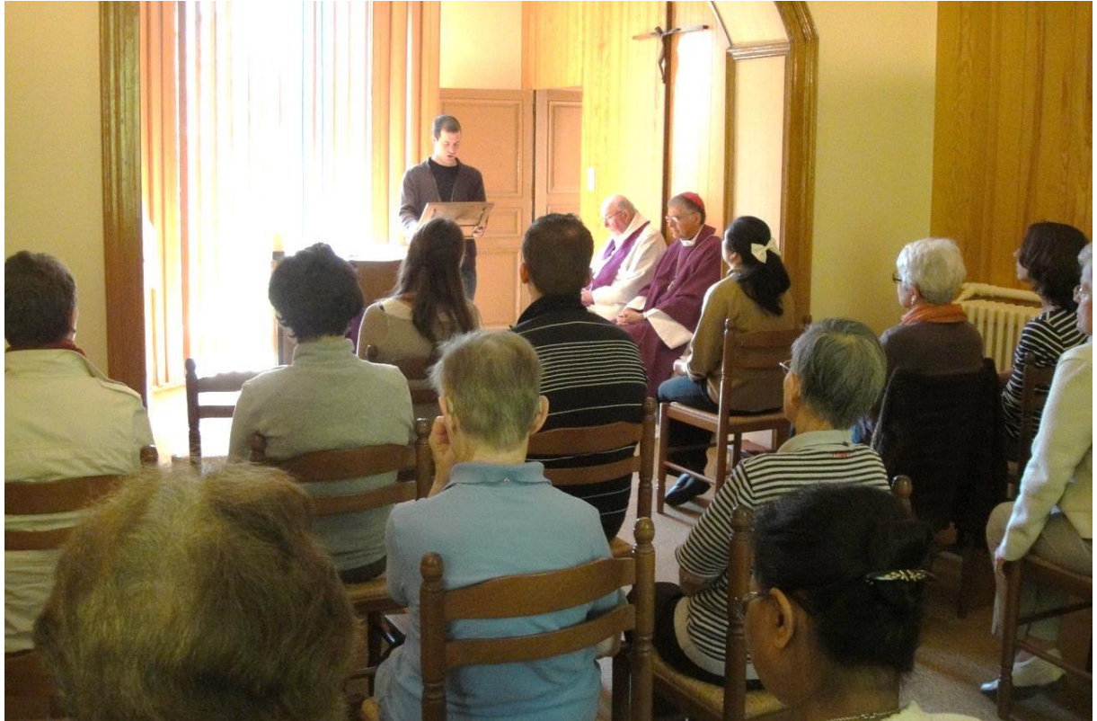
Mass in the main chapel at St Rambert with the Bishop of Belley-Ars