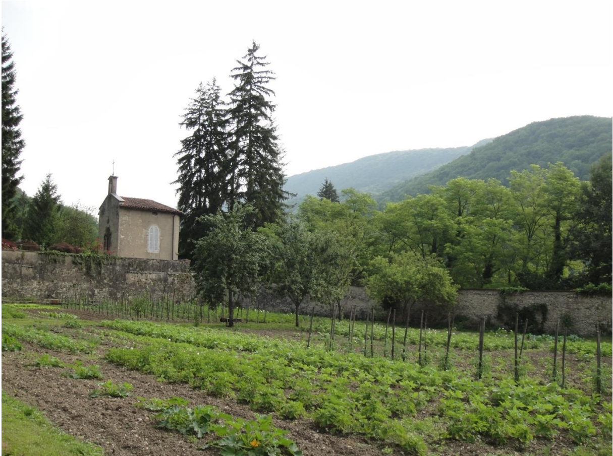
The Abbey's cuisine draws from the produce of its well-maintained garden and fruit trees