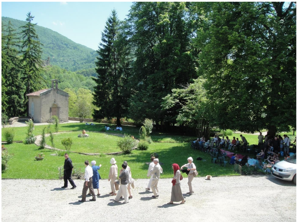
Below: Guests enjoying a summer's day at the Abbey