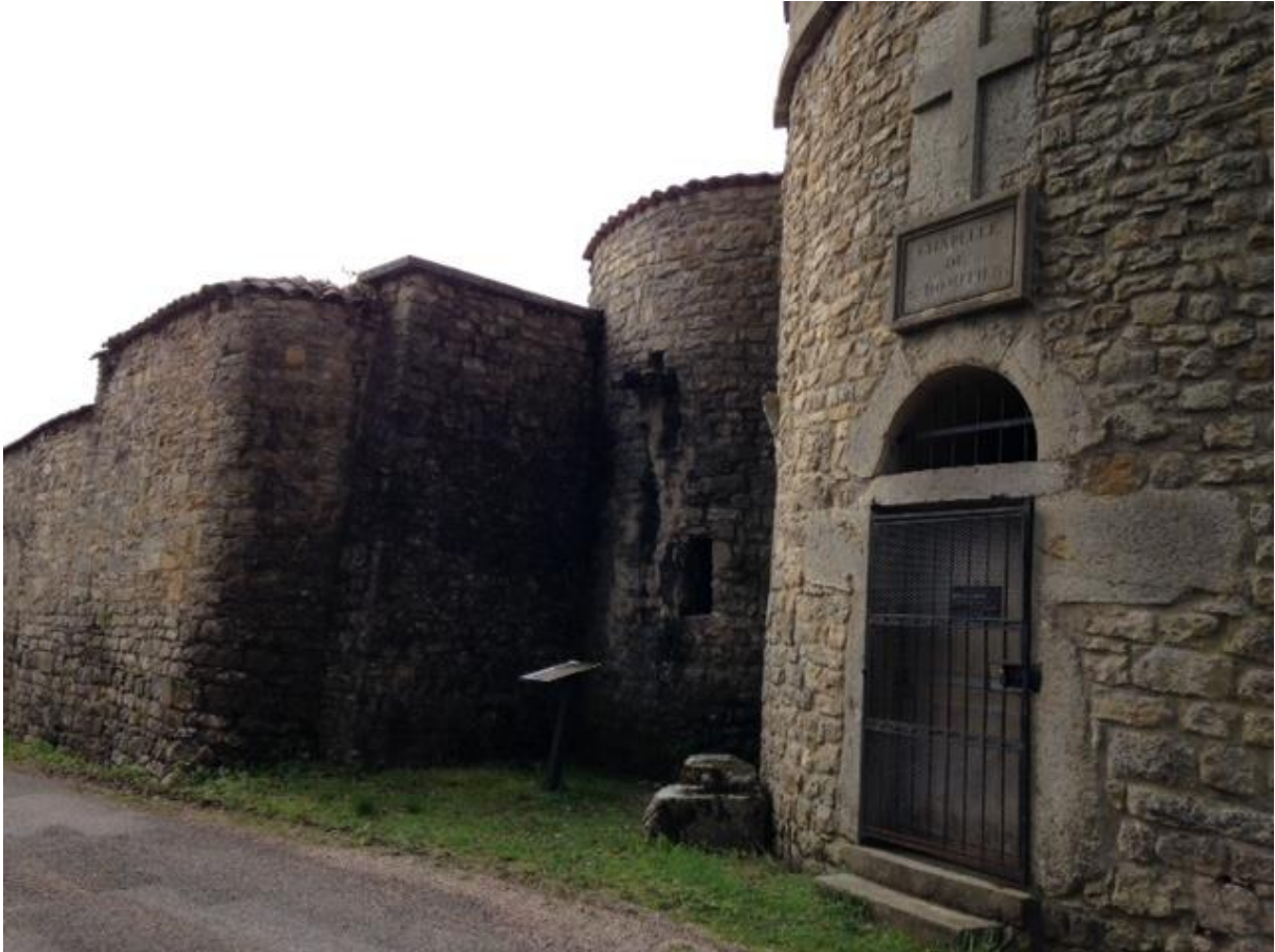
Exterior of Crypt of St Domitien, showing ancient columns and parts of an early wall surrounding the monastery.