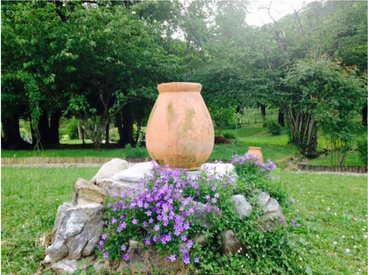
Fountain on the site of the Abbatial Church