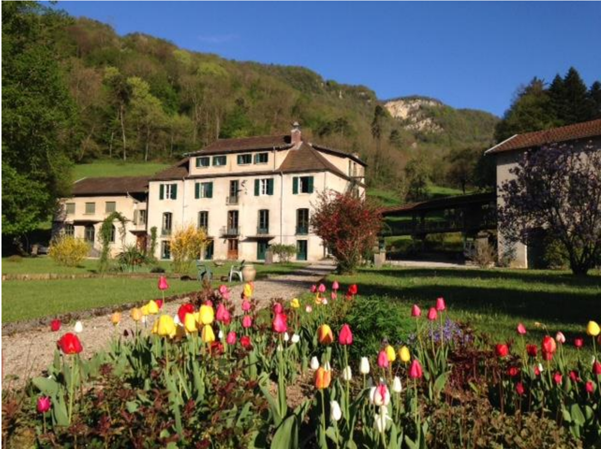
The Abbey today