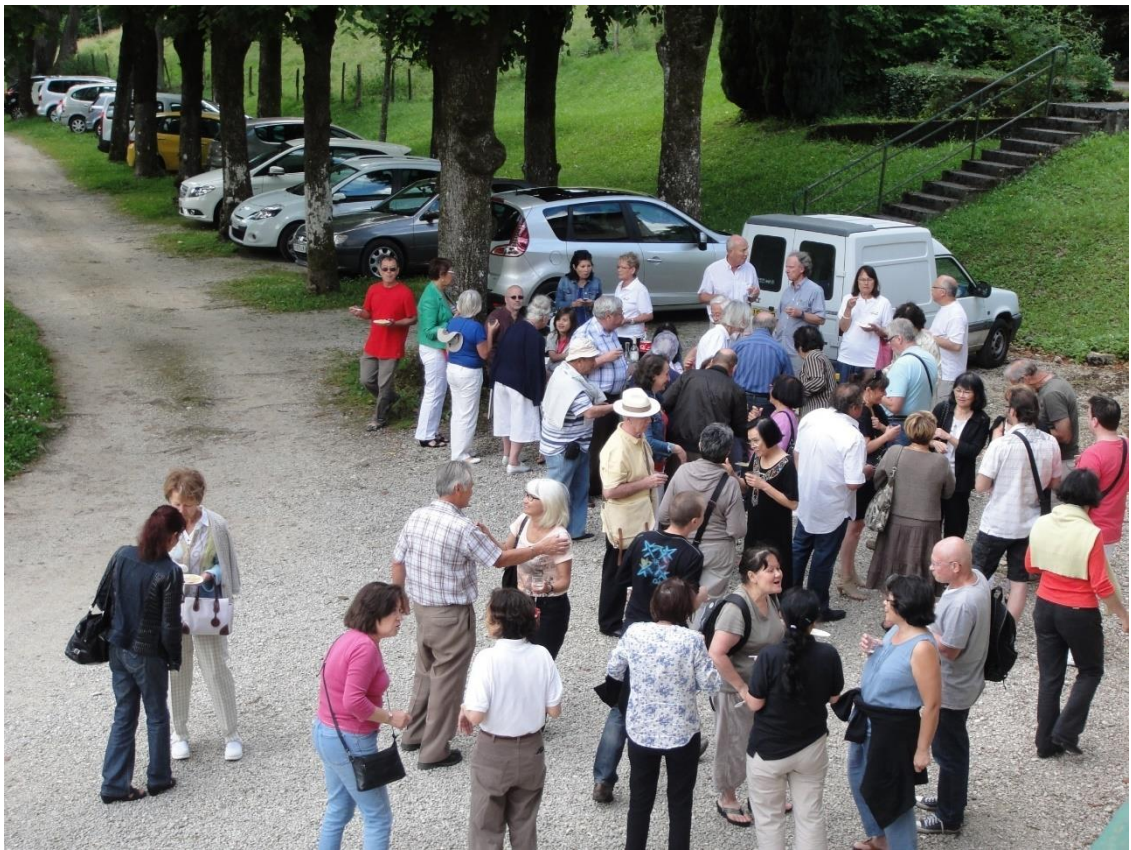
Former Eurasian Students Enjoying a Reunion at the Abbey