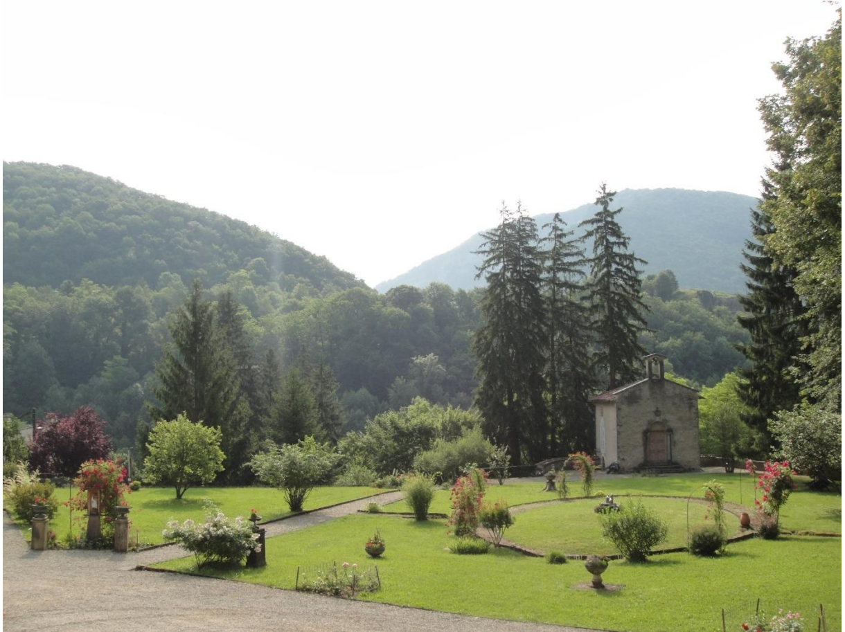
The garden chapel, built above the 9 th Century Crypt of St Domitien, at the beginning of the 19 th Century

At the beginning of the 19 th Century, the present Abbey was built over the ruins of the former monastery. In 1949 the Sisters of Our Lady of the Missions were invited to take up the ministry of the education of Eurasian children who had been brought to France from Indochina by the Federation des Oeuvres de l'Enfance Francaise d'Indochine (FOEFI). The Abbey at St Rambert was adapted for this purpose. In recognition of the care and education of more than 500 children over a period of 30 years by the RNDM Sisters, the Federation donated the property to the Congregation. In 1979 The Abbey was converted into a centre of welcome and spirituality for lay, religious and clergy.