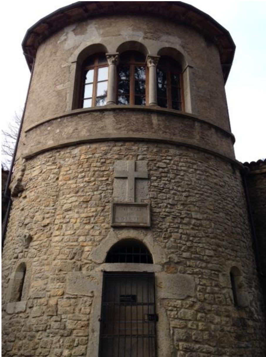
Exterior of the Crypt of St Domitien