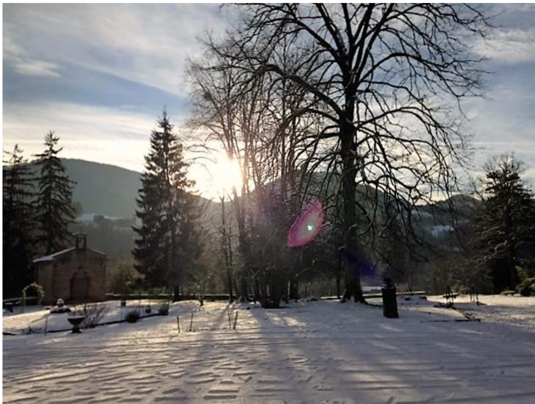
Winter at St Rambert