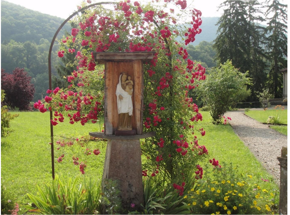
The garden in summer