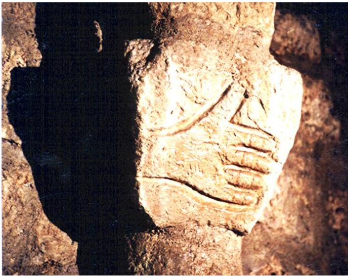
Capital inside the Crypt of St Domitien