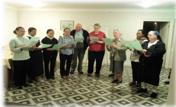
A Cultural Evening - Dancing, Singing From around the World