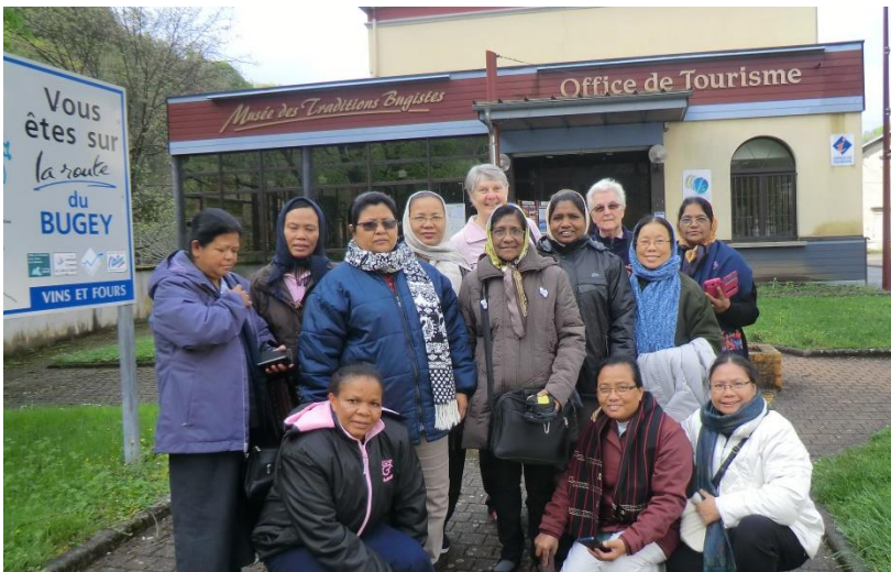
A visit to the beautiful Museum in St. Rambert