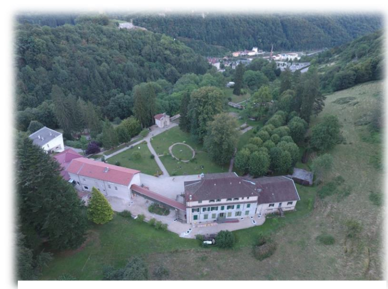
Saint Rambert taken by a friendly drone

We returned to the topic of Patrimony and reflected in small groups on our vision for mission into the future. There was a consensus around our need for a clear vision of mission, the emphasis being on a