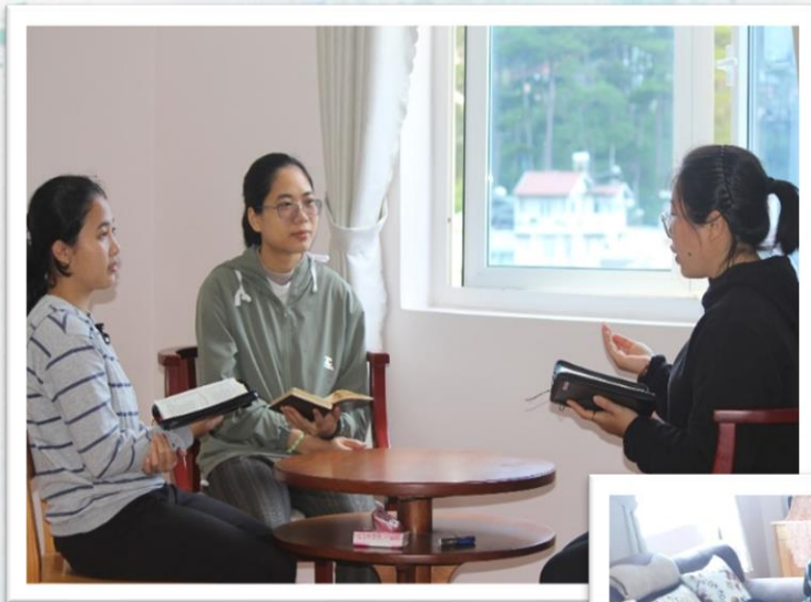
Share God's Word